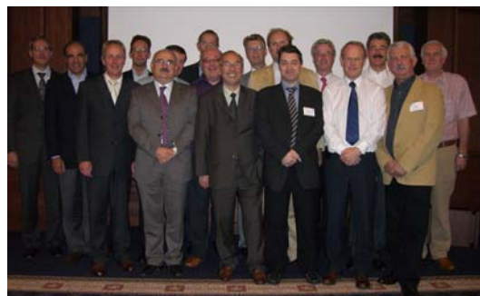
Members of Executive Committees

The following members have been elected for a new 2-years term: